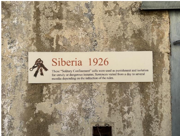
Old Idaho Penitentiary