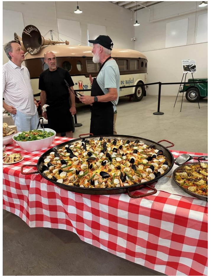
Dinner prepared by a local Basque chef in recognition of the Basque influence on Boise and Idaho