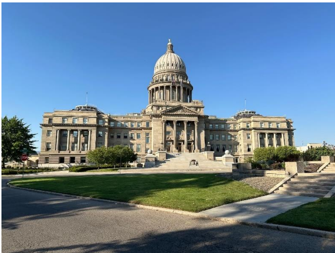
Idaho capitol building

As mentioned at the beginning of this newsletter, some photos from Boise during the National Association of Prosecutor Coordinators conference.