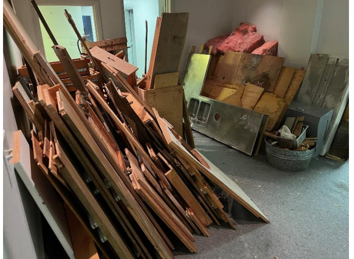
Front reception area