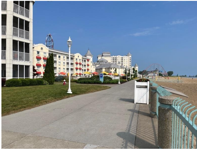
Blue skies were a welcome sight after the weather we have had for the past few years!

Thanks to all who attended. All CLE credits have been reported to the Supreme Court of Ohio.