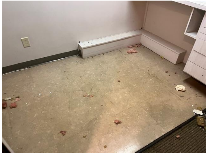
Break room area

Work is coming to an end on the third floor renovations and the new tenants are due in August 1! We welcome the Ohio Network of Children's Advocacy Centers to 196! Here are some before and after pictures: