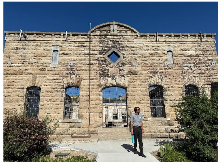
Old Idaho Penitentiary